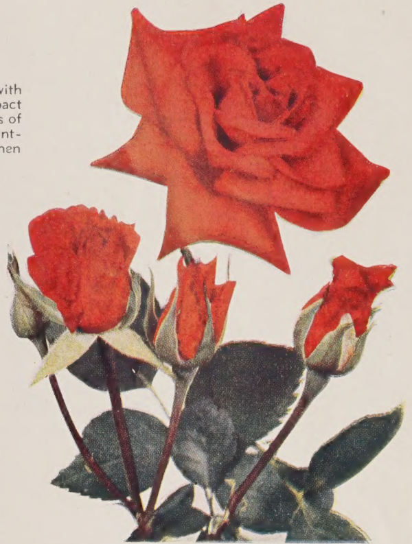
PASADENA TOURNAMENT (Plant Patent No. 578)

ROSE ELFE . Deep rose-pink buds which open to a lighter color. A fine garden variety because of its profuse and constant bloom. Each $1.25